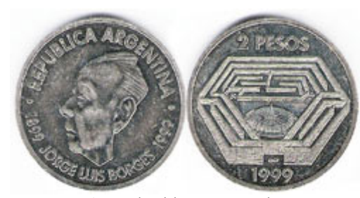
Argentine Two Pesos coin in memoriam of Jorge Luis Borges

Fuentes's novels run a range from the comical to the tragic, but they are notable for the choice of depicting commonplace and middle-class Mexico. In many instances, the figures he depicts are images raised in artistic relief against the foundation myths of Mexican culture. Fuentes also criticises Mexico, its economic and social disparities, its reliance on the United States for so many essential things, its failure to acknowledge positive influences that other cultures have brought to education, law, language even cuisine. [23]