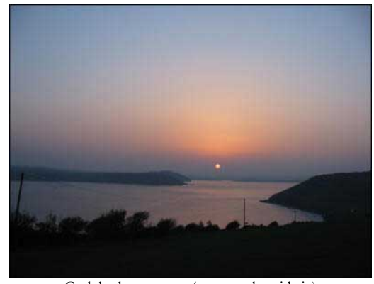
Cork harbour sunset

Many emigrants departed Ireland from here for the new world – never to return - during the sombre years of the famine and on to the halcyon days of the great passenger liners. Ships like the Lusitania , Mauritania , Bremen , Isle de France were regular callers in those heady days before the age of the jet decimated transatlantic passenger liner trade.