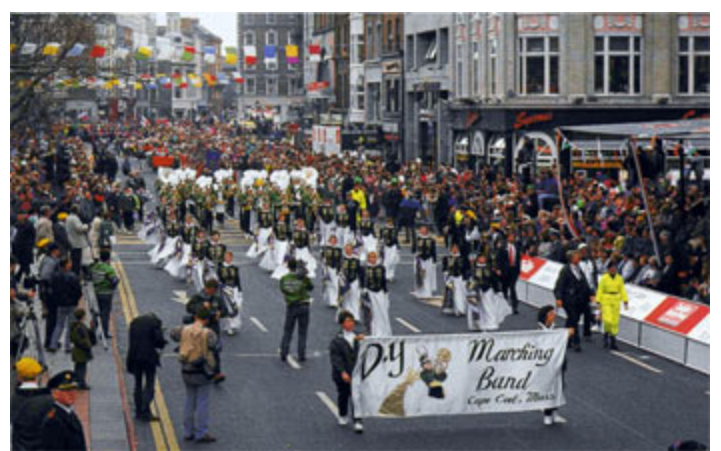
St. Patrick's Day Parade, Dublin (Embassy of Ireland in Buenos Aires)