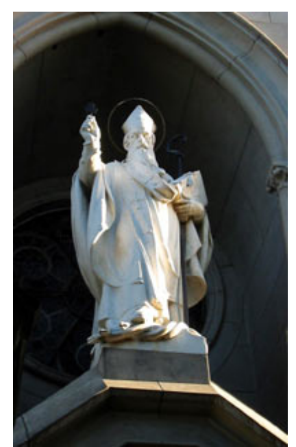
St. Patrick's church at San Antonio de Areco, province of Buenos Aires