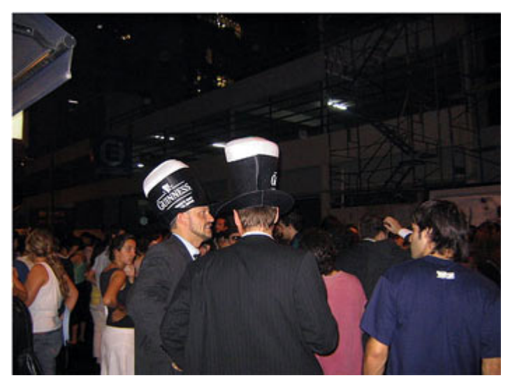
San Martín street in Buenos Aires, 17 March 2005

On 17 March 2005, some streets in the Retiro area of the city of Buenos Aires were the stage for a crowded celebration organised by the group of bars and breweries and the Government of Buenos Aires, which set the scene for a performance with its own meaning (Parente 2006). In the past four or five years these celebrations have redefined their exclusivity in order to attract tens of thousands of people, the majority of whom have no connection to the migrant group, and who consume large quantities of beer. Using first-hand observation as a means of surveying, we noticed that the party in Retiro mainly attracted the active participation of young people, the majority from a middle-class social group, particularly office staff who work in downtown Buenos Aires and who join in the celebration after finishing work.