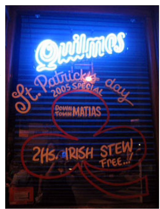
Beer advertising at a public house in Buenos Aires, 17 March 2005

which are repeated, stripping the message of nuance and complexity so that it may be effectively appropriated by the public.