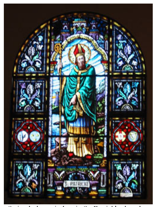
Stained-glass window in St. Patrick's chapel at Santa Lucía, district of San Pedro, province of Buenos Aires (Edmundo Murray, January 2003)

With these theoretical bases, we compiled an archive of material relating to the celebration of St. Patrick's Day, understanding archive in the etymological sense of arkhé or principle of organising the past and memory (Derrida, 1997). In putting together this archive, we adopted a genetic hypertextual focus (Palleiro 2004a 2004b) which proposes a means of ordering materials capable of reflecting its own process, leaving the marks of the dynamic of construction or genesis and its itineraries of circulation visible,