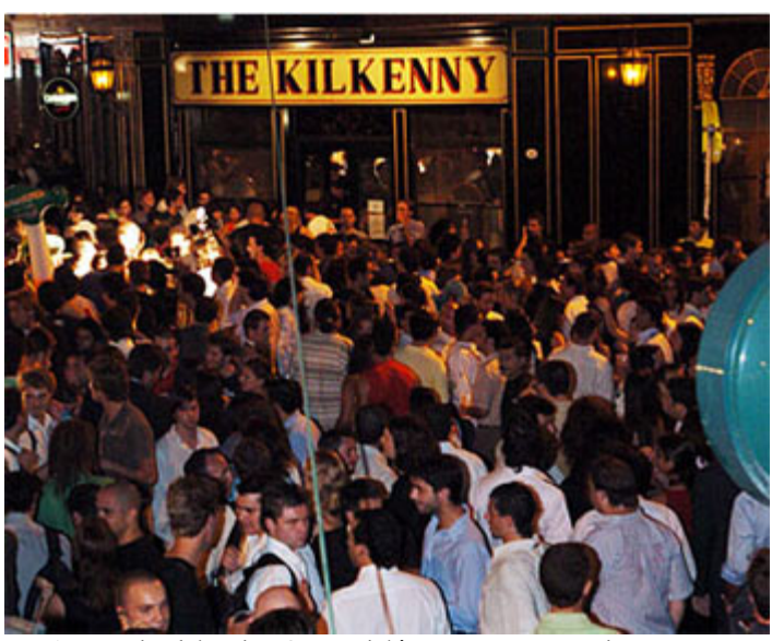
A crowd celebrating St. Patrick's Day at Reconquista street, downtown Buenos Aires

The celebrations of 2006 showed signs of the impact of an intertextual network of debates about the absence of security, [3] initiated by